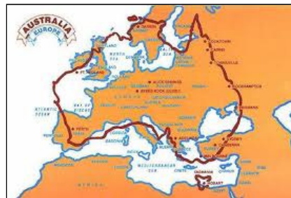
Figure 1 – Map showing a general comparison of the size (area) of Australia when overlaid on a base map of mainland Europe

Australia is a vast continent. Figure 1 provides a visual comparison of its size when compared against mainland Europe.