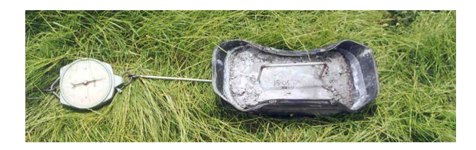
Figure 1: Tyre dragging test in progress

A New Zealand manufactured tyre with a tread depth of about 1.5 to 2mm was cut and filled with concrete and lead weights, then fitted with towing eyes to enable it to be dragged with a calibrated spring balance attached. The total weight of the filled part-tyre was 15.05 kg. Figure 1 shows a photo of the tyre drag sled being used to obtain friction coefficient measurements.