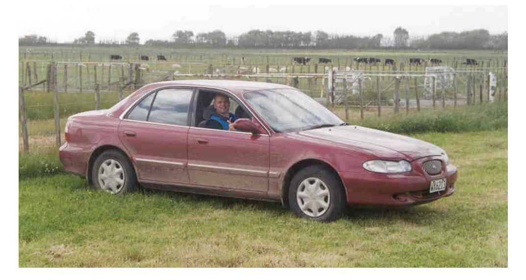
Figure 2: Vehicle used for test skids

A non-ABS (Antilock-Braking-System) late model Hyundai Sonata, shown in Figure 2, was used to perform test skids. It was instrumented with a calibrated Vericom<sup>TM</sup> VC2000 supplied by the New Zealand Police. This single accelerometer based device, shown in Figure 3, continuously records the deceleration time history during braking, which can be downloaded to a computer for viewing. It is mounted on the test vehicle's windscreen and can be activated externally from the brake lights or internally by the braking force of the test vehicle.